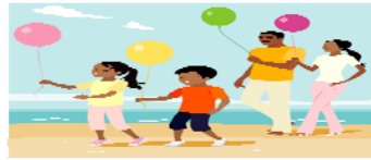
Our families make us special!

work in that classroom. Please do not interrupt lessons or try to confer with teachers. You can schedule a separate meeting with the teacher for your questions.